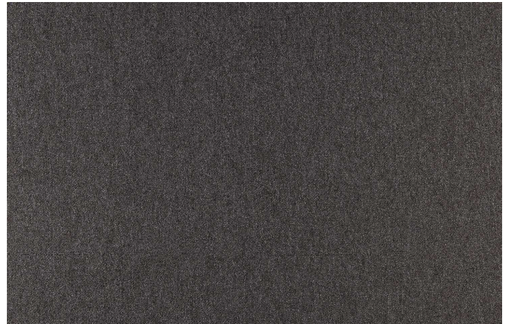
COBALT SDN 64051