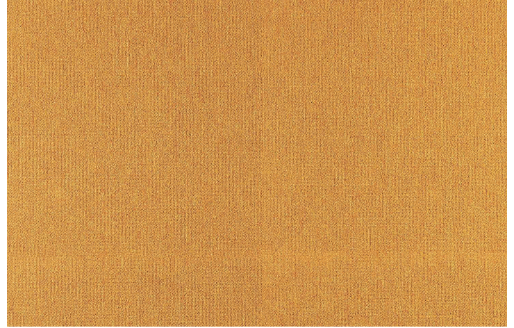
COBALT SDN 64049