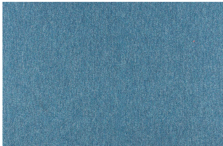
COBALT SDN 64063