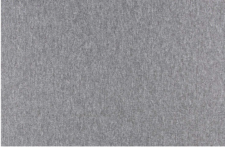
COBALT SDN 64042