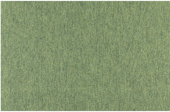
COBALT SDN 64073