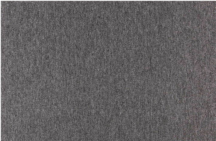
COBALT SDN 64050